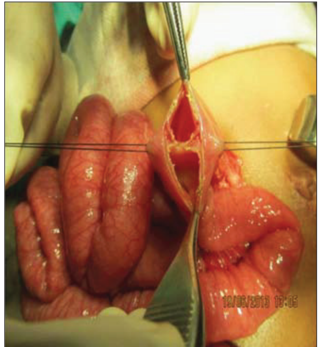
Fig. 2. Intra-operative image of the first patient showing the jejunal web.