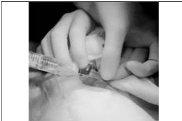
Fig. 3. Intraoperative view: local lidocaine injection.

Ryc. 2. Zdjęcie śródoperacyjne: uwięźnięta lewostronna przepuklina pachwinowa: martwiczo zmienione jądro.