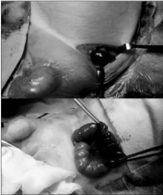
Fig. 2. Intraoperative view: incarcerated left inguinal hernia: necrosis of the testis.

Ryc. 2. Zdjęcie śródoperacyjne: uwięźnięta lewostronna przepuklina pachwinowa: martwiczo zmienione jądro.