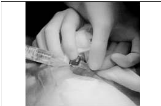
Fig. 3. Intraoperative view: local lidocaine injection.

Ryc. 2. Zdjęcie śródoperacyjne: uwięźnięta lewostronna przepuklina pachwinowa: martwiczo zmienione jądro.