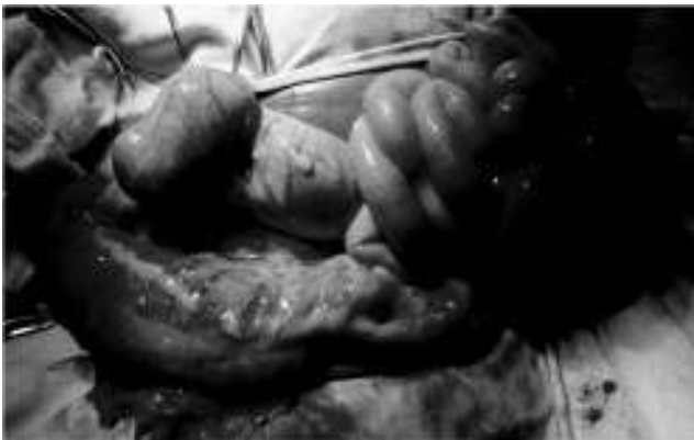
Fig. 1. Grossly dilated colon transverse and sigmoid colon.